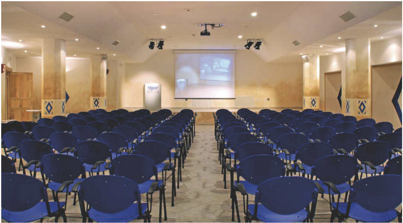
Conference Centre with 180 seats, main plenary hall with 150 seats and a break-out room with 30 seats.