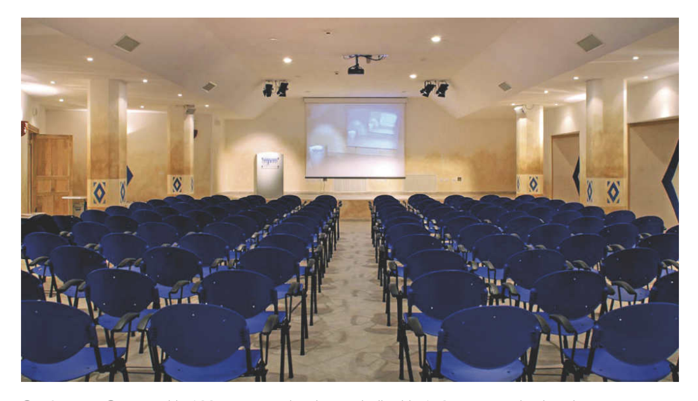
Conference Centre with 180 seats, main plenary hall with 150 seats and a break-out room with 30 seats.